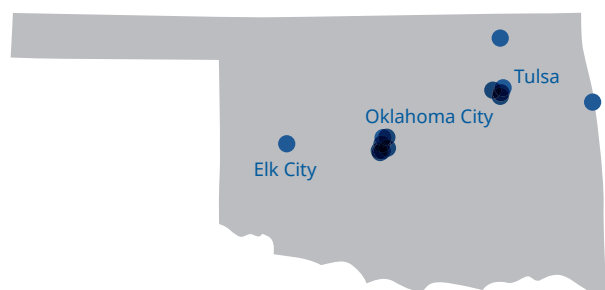
ABB Alfa Laval Ameristar Atlas Copco Axel Christiernsson Camfil Clima Cool ClimatCraft Climate Control Group ClimateMaster Covanta H&M Heritage Environmental Service IEC International Environmental KOAX Kodiak Gas Services Lazer Logistics Loomis Roxtec Securitas ThermaClima Volvo Group